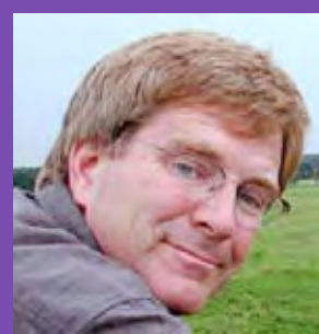
Rick Steves' Europe

Travel shows will be featured from 8-9 a.m., 2-3 p.m., 8-9 p.m. and 2-3 a.m.