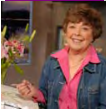
Scheewe Art Workshop

The painting/crafting block—airing from 5-6 a.m., 11 a.m.-noon, 5-6 p.m., and 11 p.m.-midnight—includes: