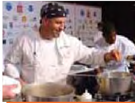
Great American Seafood Cook Off

Travel shows will be featured from 8-9 a.m., 2-3 p.m., 8-9 p.m. and 2-3 a.m.