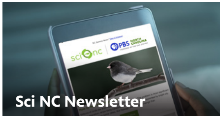
Sci NC Newsletter

Science lovers and science teachers will enjoy this twice-monthly look at North Carolina science stories and engaging lesson plans.