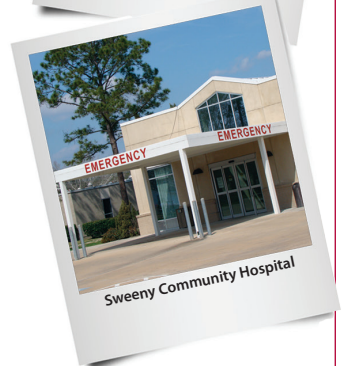
Sweeny Community Hospital