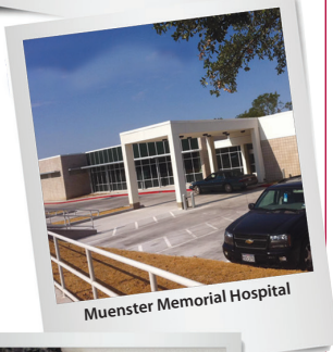
Muenster Memorial Hospital