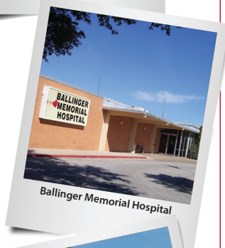
Ballinger Memorial Hospital