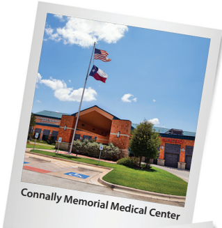
Connally Memorial Medical Center

Prepared by the Texas Organization of Rural & Community Hospitals